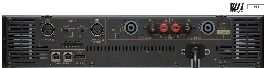
T5n Rear Panel